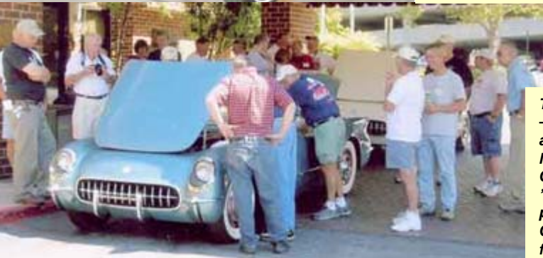
The 3 pictures, 1 – 3, were taken at the SACC National Convention of a '55 which was purchased at the Carlisle auction for $130K, by a SACC member. $16,250/cylinder