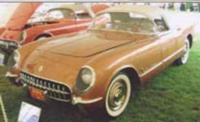
(above) A copper '55! (below) Black '54, 1 of 6.