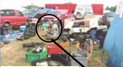
Typical Vendor Site!