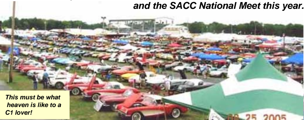
This must be what heaven is like to a C1 lover!