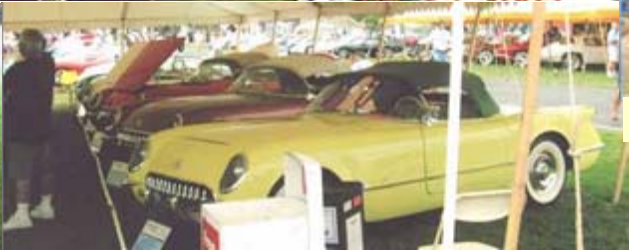
A coral '55, 1 of every color produced!