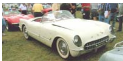
'53 Pro Team, VIN # 100, No Sale @ $90K. It actually ran!