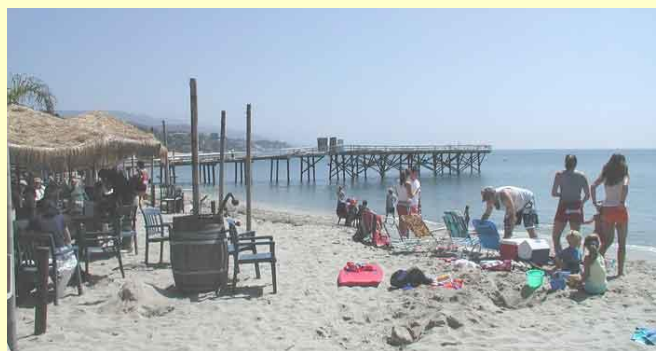
"The Beach Scene" before noon. The arrivals claim their spot of sand.