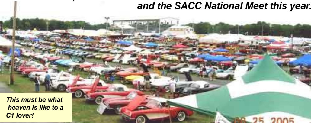
This must be what heaven is like to a C1 lover!