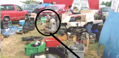
Typical Vendor Site!