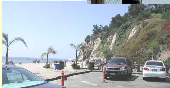
Reportedly, this is the location that the "Rockford Files" trailer was parked.