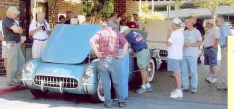
The 3 pictures, 1 - 3, were taken at the SACC National Convention of a '55 which was purchased at the Carlisle auction for $130K, by a SACC member. $16,250/cylinder