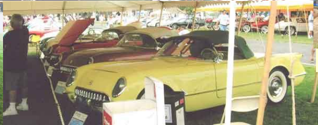
A coral '55, 1 of every color produced!