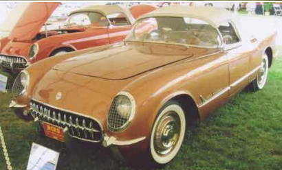
(above) A copper '55! (below) Black '54, 1 of 6.