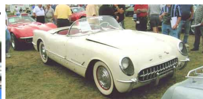
'53 Pro Team, VIN # 100, No Sale @ $90K. It actually ran!